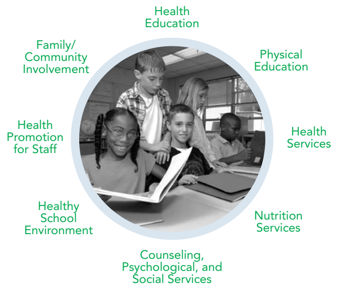
Figure 1 Components of the Coordinated School Health Model

Typically, a school health coordinator, guided by a school health council or team, focuses on integrating efforts across these eight interrelated components to address health issues. Effective school health programs